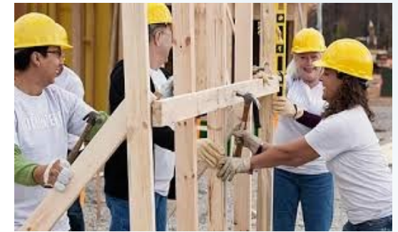
Tax Rebate Incentive Program