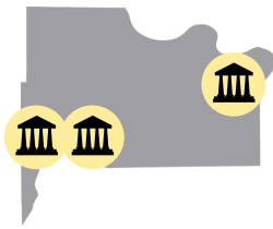
Local Government Entities*