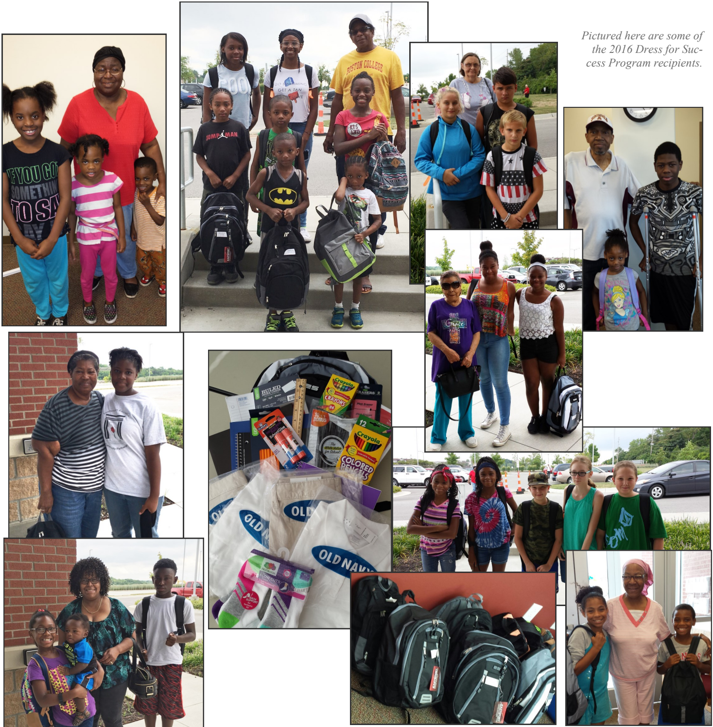
Pictured here are some of the 2016 Dress for Success Program recipients.

Funding was provided through the Kansas Department for Aging and Disability Services, Older Americans Act and the Family Caregiver Support Program.