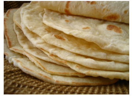
Yields 2 dozen tortillas