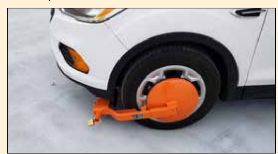
KCK will start using a parking "boot" on cars with a large number of unpaid parking tickets.

CBK assists the court with research, collections and disputes.