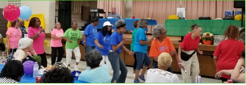
Mz Gee Gee's Exercise/Line Dance Class is always encouraging audience participation as they keep in step.