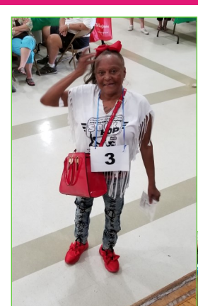
2nd Place Dance Contest Winner