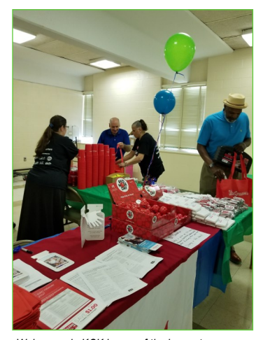
Walgreens in KCK is one of the longest sponsors of the Sock Hop, providing free health screenings.