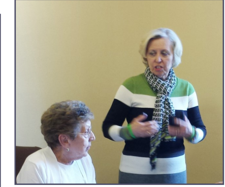
Above: Senator Pat Pettey takes a moment to share her views on getting Kansas back on track as it regards to its budget shortfall.