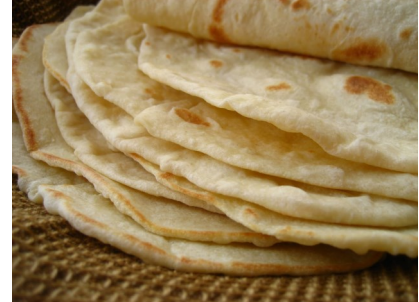
Yields 2 dozen tortillas