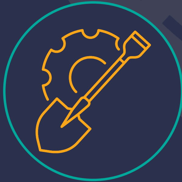
INFRASTRUCTURE AND BUILT ENVIRONMENT