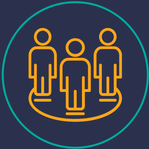
COMMUNITY HEALTH AND WELL-BEING

VALUES FOR OUR RECOVERY Equitable, Collaborative, Innovative & Resilient