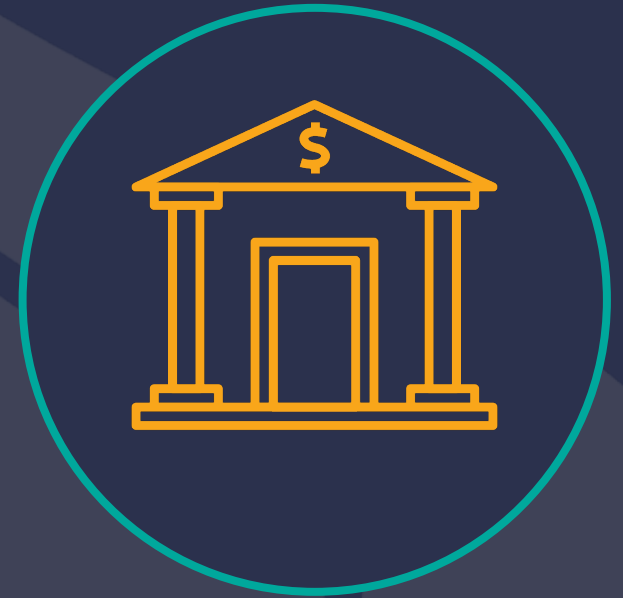
ORGANIZATIONAL AND COMMUNITY RESILIENCE