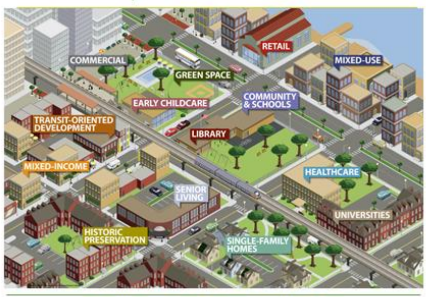
HEALTHY CAMPUS CHOICE NEIGHBORHOOD, KANSAS CITY, KANSAS

Really quickly what's meant by placed-based, for a long time development looked like this. You had commercial development over here. You had community's and schools maybe developed over here. Single-family housing and retail and what HUD has figured out is that a complete community connects all of those things and also fill in the gaps with things like libraries, grocery stores, health care, senior living facilities, mixed-income housing in addition to just having these single-family homes, schools, retail, and commercial.