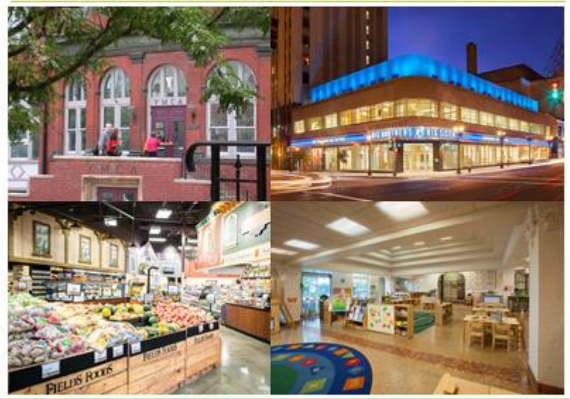
HEALTHY CAMPUS CHOICE NEIGHBORHOOD, KANSAS CITY, KANSAS

For the action portion we have $1.5M from Choice. US Bank has already committed $3.88M when we did the grant to support this activity in new market, equity, and debt. Then the $5.2 other depends on what activity we choose, but that's typically first mortgage whoever the tenant is, but the portion of that activity is typically with the $1.5M from the grant and the $3.8M from the new market equity and debt; new market, equity and traditional debt; it's pretty easy to find the $5.2M.