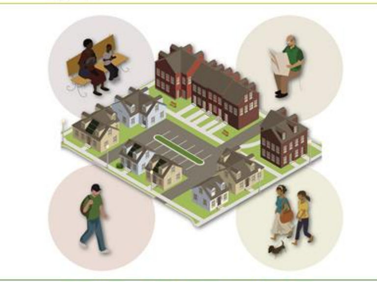
HEALTHY CAMPUS CHOICE NEIGHBORHOOD, KANSAS CITY, KANSAS