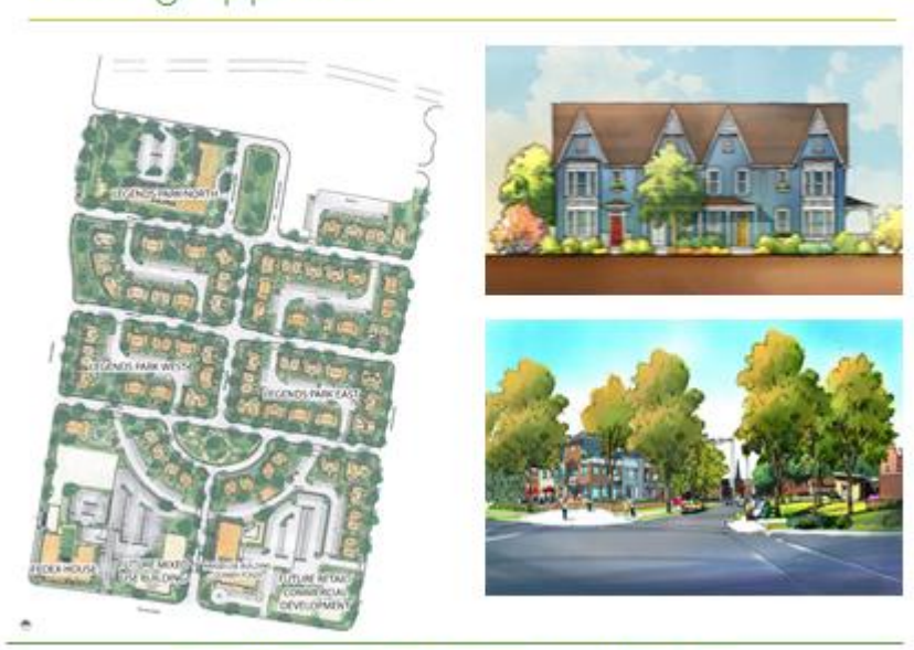
HEALTHY CAMPUS CHOICE NEIGHBORHOOD, KANSAS CITY, KANSAS