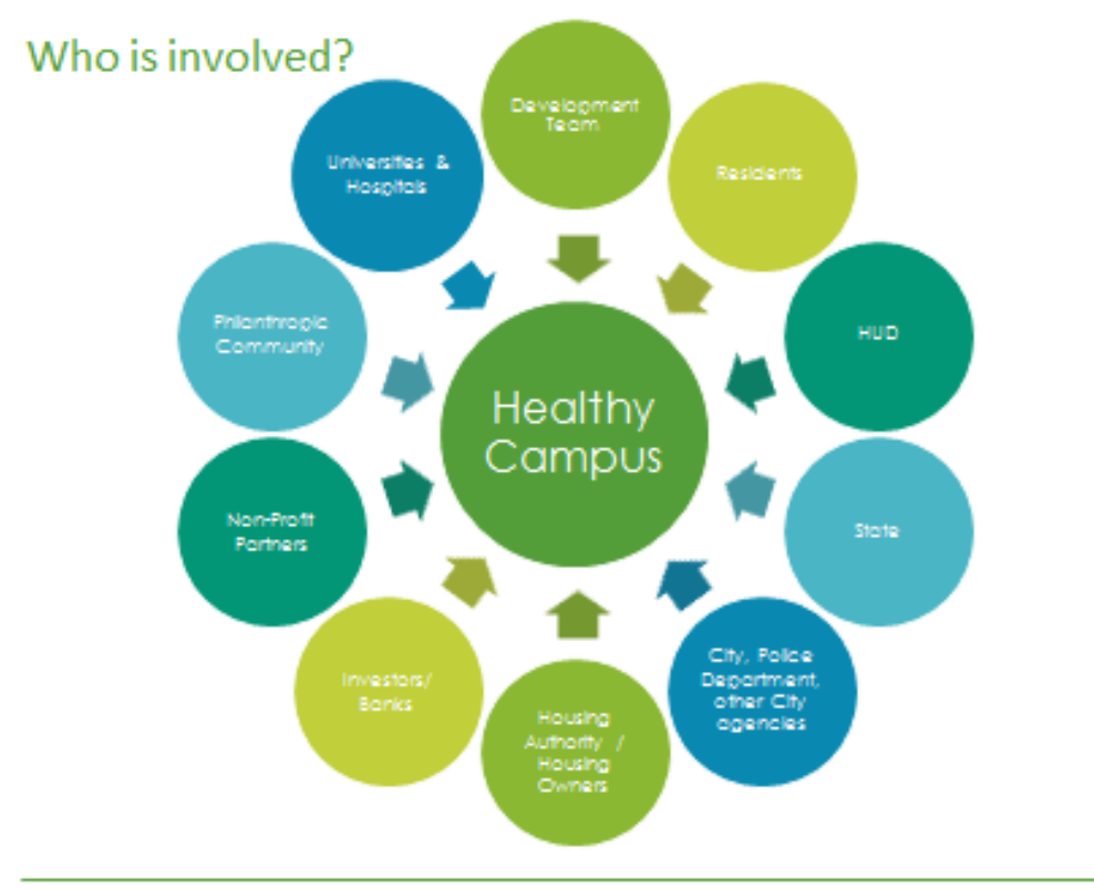
HEALTHY CAMPUS CHOICE NEIGHBORHOOD, KANSAS CITY, KANSAS

LISC has committed $800,000 in the project that they are doing in the neighborhood and that also includes additional money that they're committing to the Healthy Campus Project. The $250,000 is the UG that we just committed.