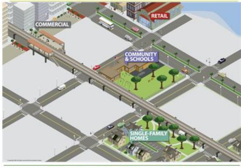
HEALTHY CAMPUS CHOICE NEIGHBORHOOD, KANSAS CITY, KANSAS