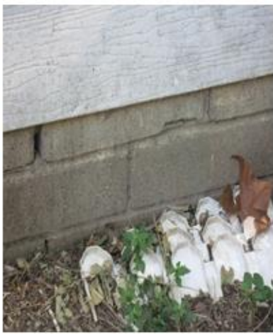
Condition of House