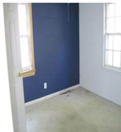
Condition of House