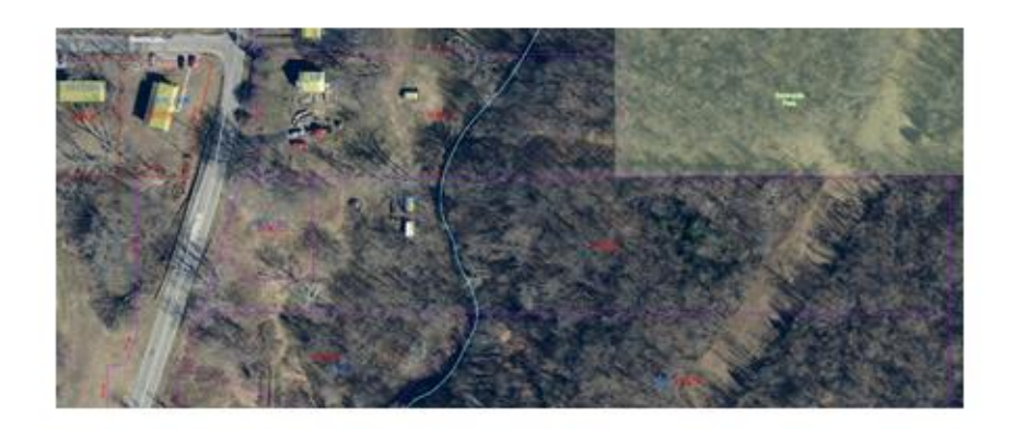
5320 State Ave