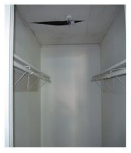
Condition of House