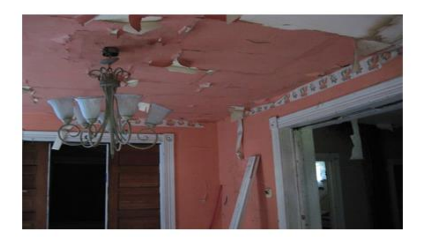
Condition of House

Just further deterioration of the property.