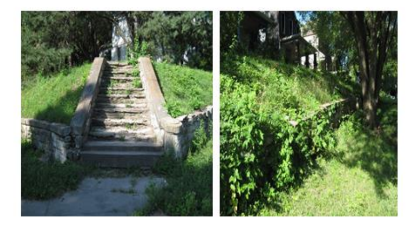
Condition of House

Some conditions of the house. It was in pretty—well, it still is. It hasn't been demoed yet.