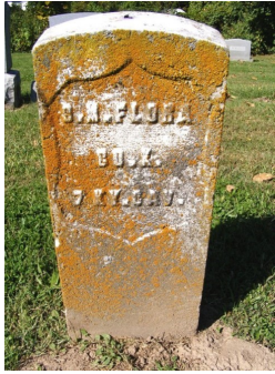
1. Flora: GPS 39.12924686, -94.6700633