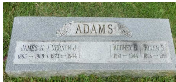
13. Adams: GPS 39.1309645, -94.6721287