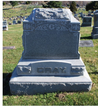
5. Gray: GPS 39.1310068, -94.6719870