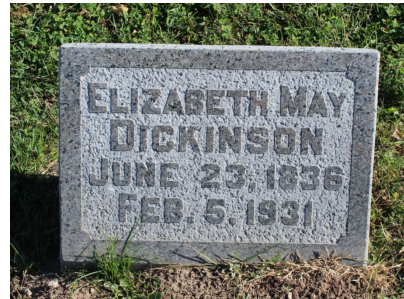
7. Dickinson: GPS 39.128404, -94.67233244