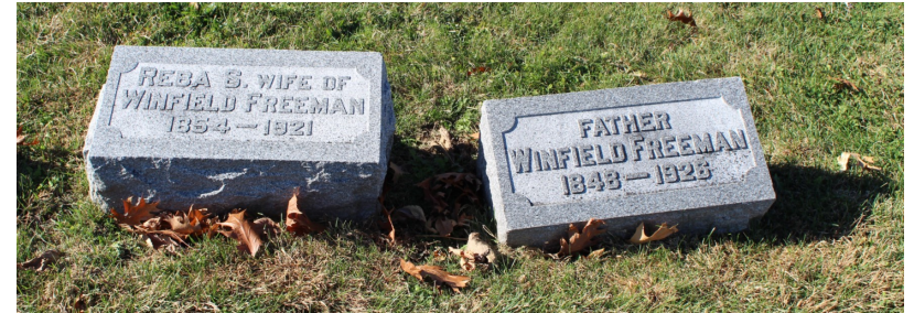
4. Freeman: GPS 39.1310061, -94.6719929