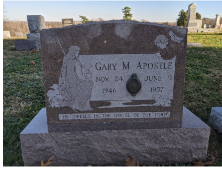
2. Apostle: GPS 39.1292618, -94.6729806