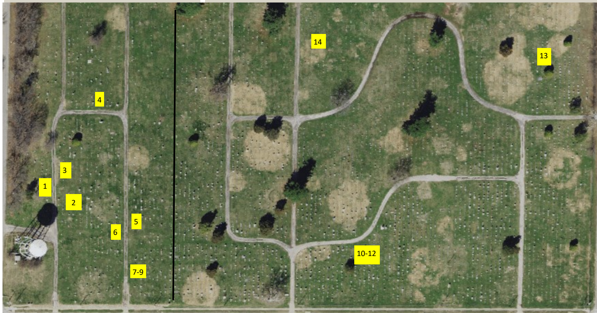
Approximate dividing line Quindaro and Mt Hope