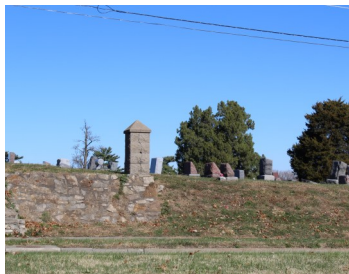
Dividing wall between the two cemeteries, the rest of tour is in Mount Hope .