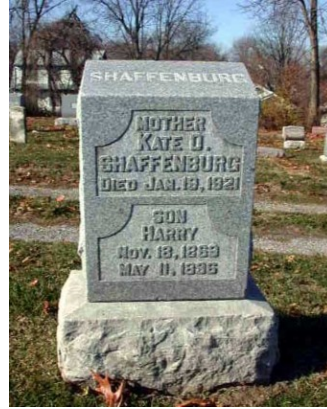
3. Shaffenburg: GPS 39.1292618, -94.6729806