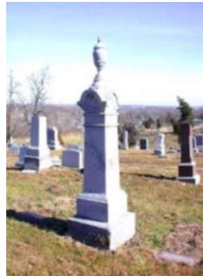
6. Klamm: GPS 39.1310068, -94.6719870