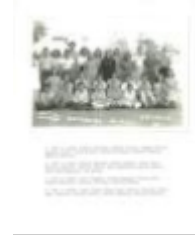
photo scan of Quindaro School, 6th grade Class of 1941 with people in the picture identified. Scan of 2008.010.06.