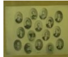
photo of first graduating class of District No.9, Oakland School at 26th and Muncie Blvd. May 28, 1897