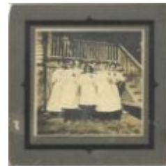
Photo-seven unidentified girls, possibly at Rosedale High School or Greystone School, c.1910.