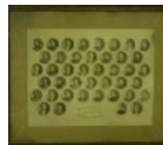
photo of class at Oakland School at 26th and Muncie Blvd. Wy Co.